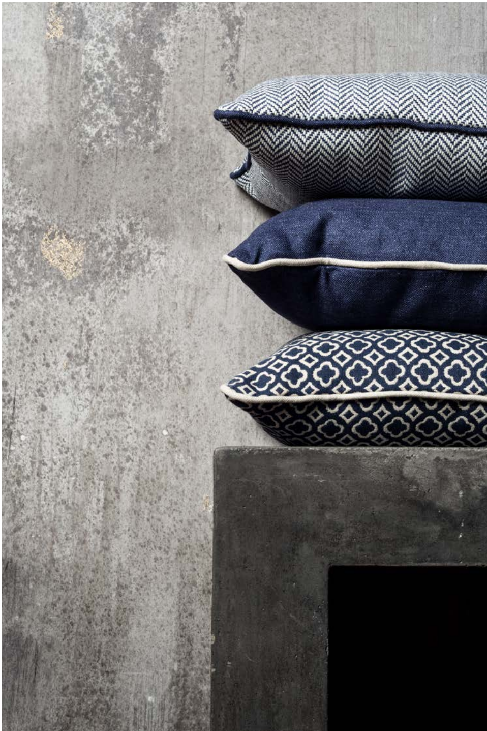
Fabrics: Medici 100, Narciso 101, Ortolano 100