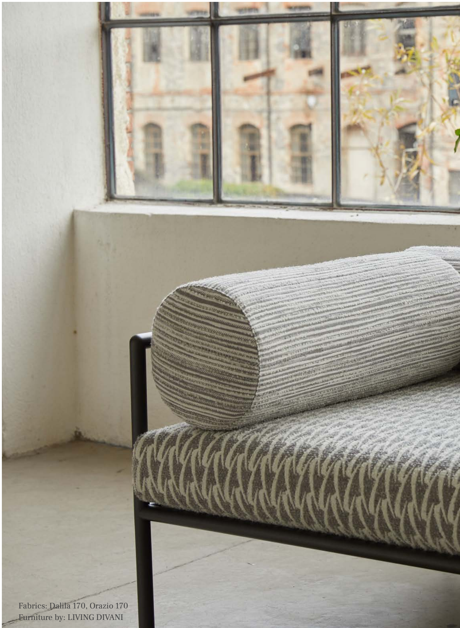
Fabrics: Dalila 170, Orazio 170 Furniture by: LIVING DIVANI