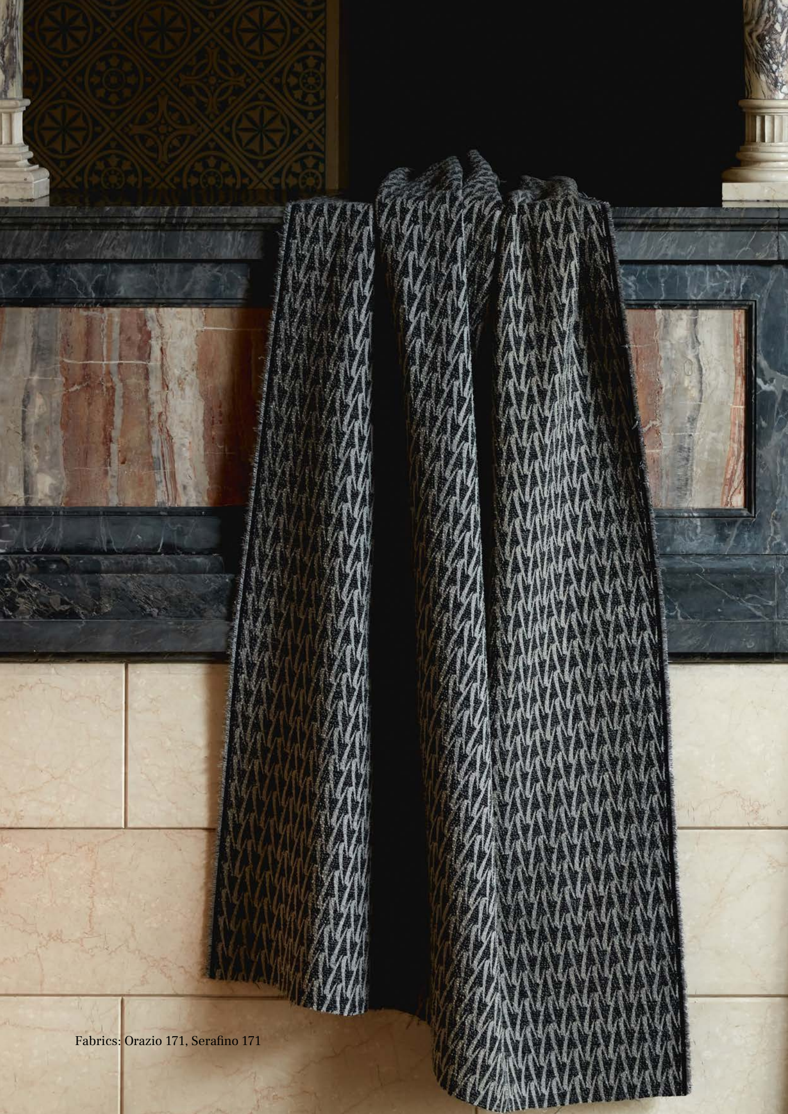
Fabrics: Orazio 171, Serafino 171