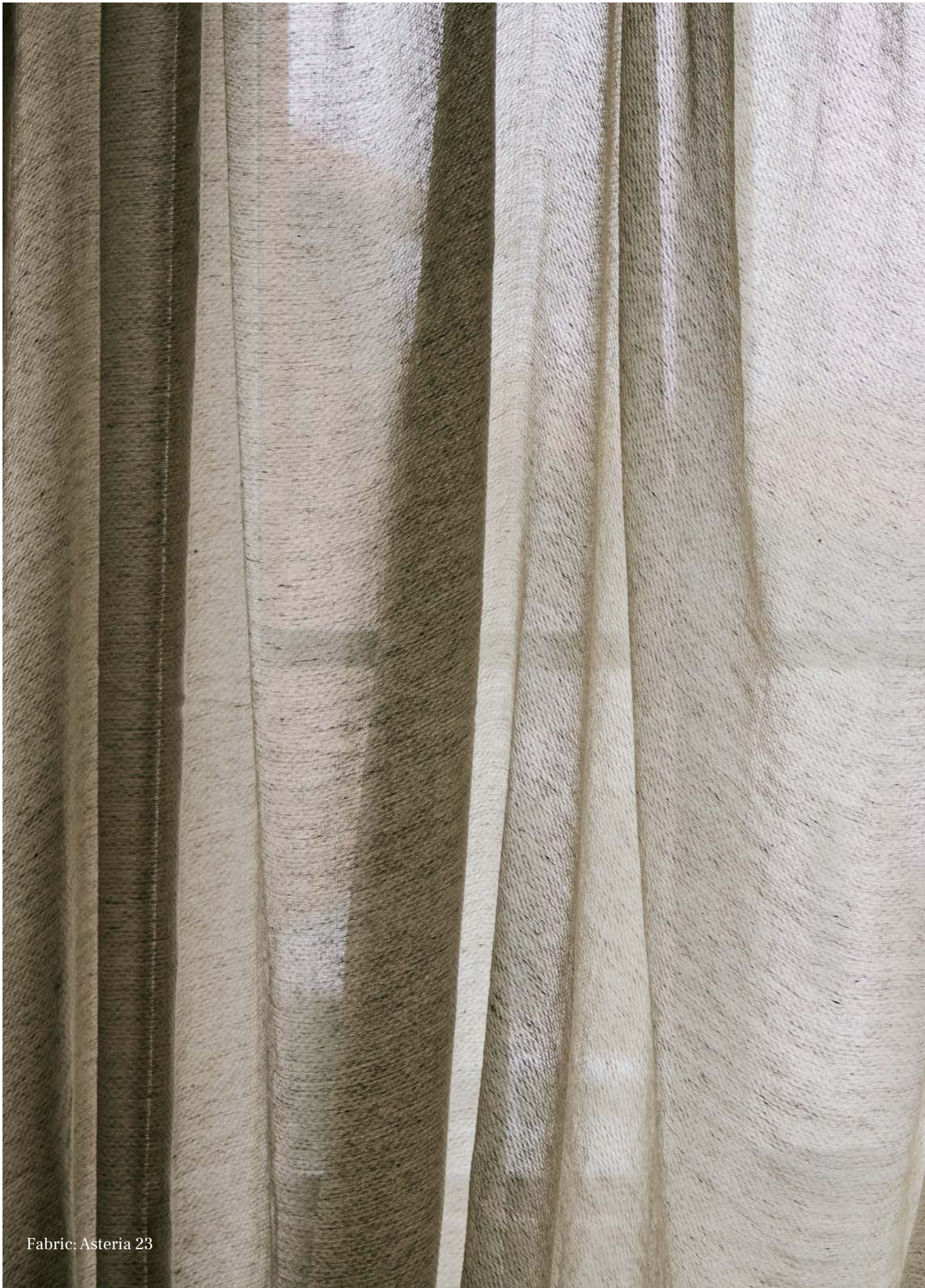
Fabric: Asteria 23