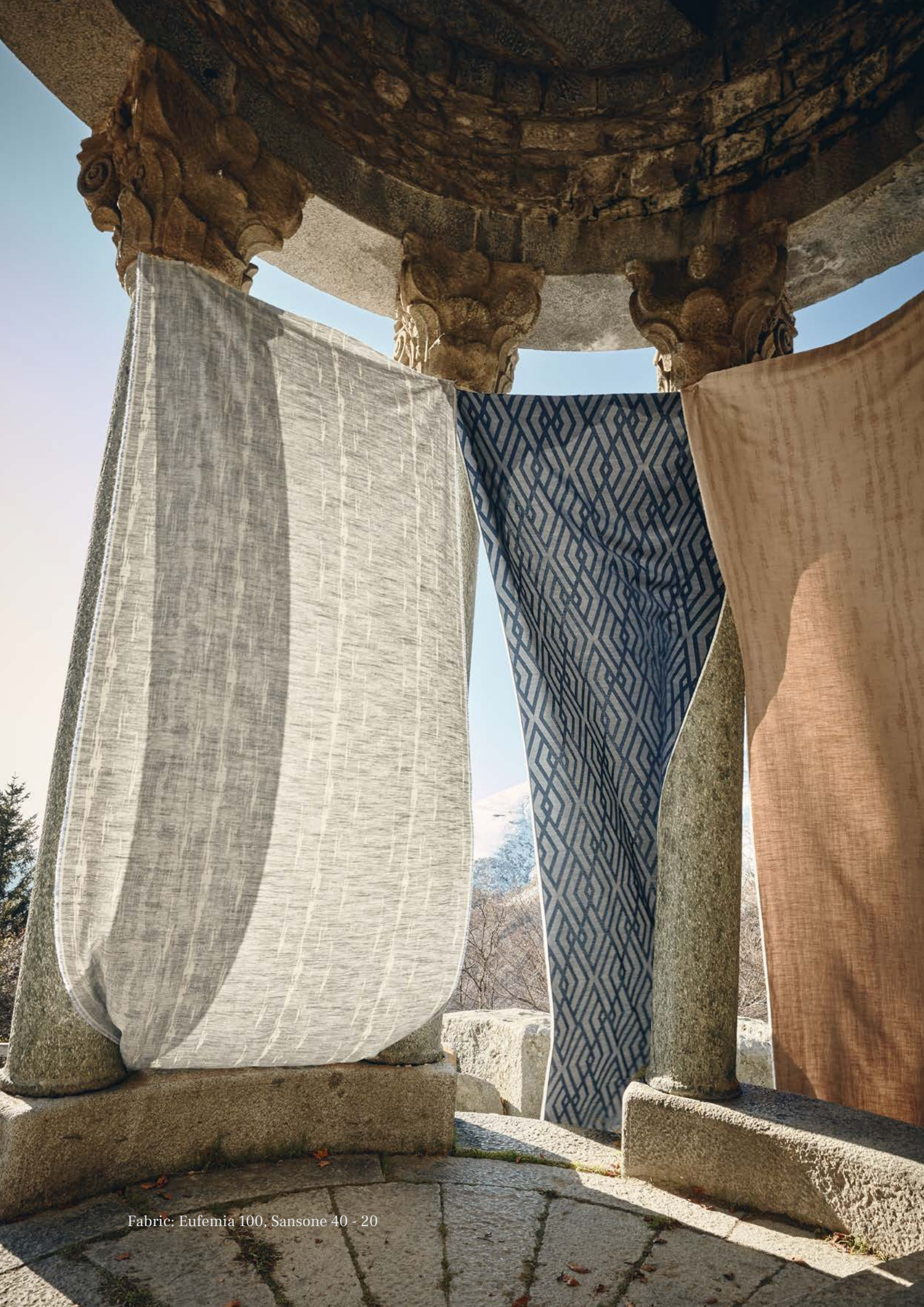
Fabric: Eufemia 100, Sansone 40 - 20